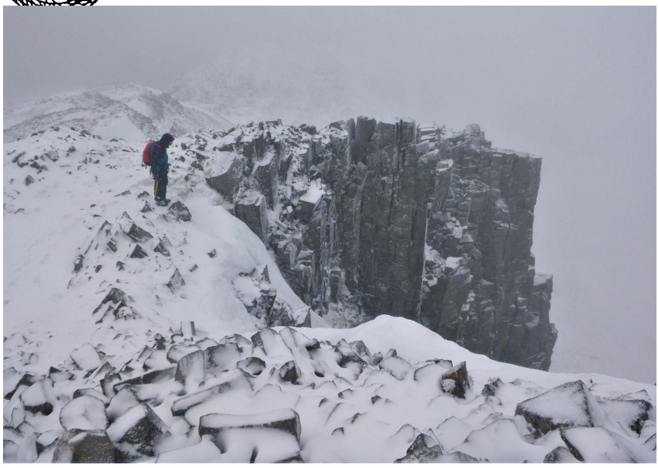
Seeking the way down from Stob Coire nan Lochan. See page 11 for the story.